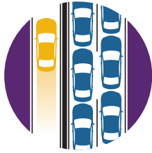
5 Major Express Lanes Projects